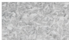
Galvanized (00) Non-Painted Finish - No Warranty