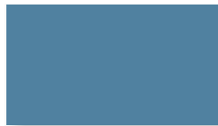
Hawaiian Blue (70)