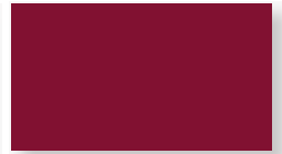
Dark Red (46)